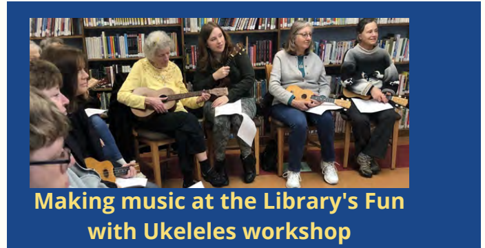
Making music at the Library's Fun with Ukeleles workshop

The library participated in the Health Fair at the Sullivan County Elementary School. October is Health Literacy Month, so the library chose that as their theme this year. The library had a raffle basket for the event thanks to the Friends and the United Way of Lycoming County serving Sullivan County. The Health Fair is a great way to also network and reconnect with people.