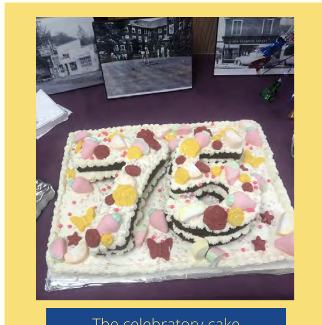
The celebratory cake

A beautiful themed cake, coffee, and a slideshow about the 75 years of Sullivan County Library were featured at the Library. The slideshow featured pictures of the various locations of the Library over the years and the people who staffed the Library. The slideshow can be viewed on the Library webpage at www.sullivancountylibrary.org .