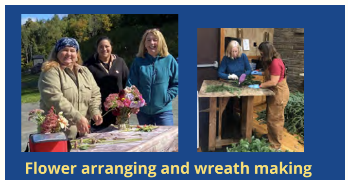
Flower arranging and wreath making