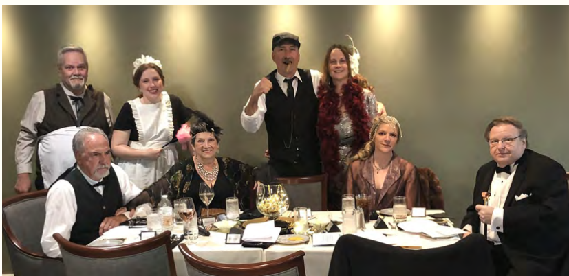
The cast of the Roaring '20s Murder Mystery