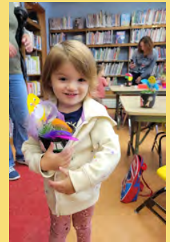
Story Hour creation

Finally, the library is working on objectives of its strategic plan, namely, outreach to target groups such as teens and young adults, exploring options for programming for seniors, building several of the library's special collections, and improving use of the library building. The library's Advisory Board will be meeting again in January and meets quarterly throughout the year.