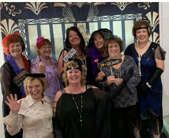
Flappers at the Murder Mystery

If you are receiving this newsletter in the mail and would be willing to receive the newsletter by email to save postage for the Friends, please send your email address to Friends.SC.Library@gmail.com to get on our email list.