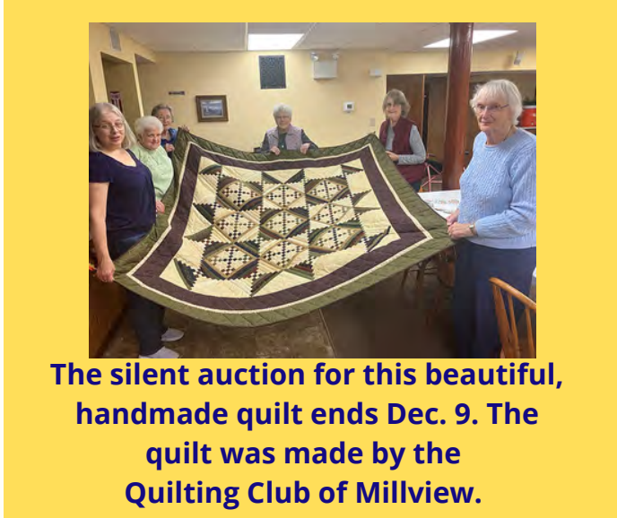
The silent auction for this beautiful, handmade quilt ends Dec. 9. The quilt was made by the Quilting Club of Millview.