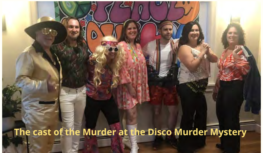
The cast of the Murder at the Disco Murder Mystery

The murder narrative unfolds in three acts between courses of the meal. The Country Club served a delicious three course meal featuring a buffet of Shrimp Scampi and Chicken Parmesan. The event realized over $2700 profit which will be used to benefit the Library.