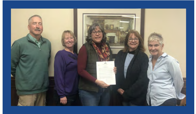
PROCLAMATION FRIENDS OF LIBRARIES WEEK OCTOBER 15-21, 2023