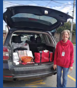
WIC & JobFest