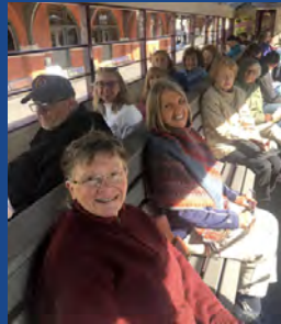
Excursion to Jim Thorpe

Please note the library has increased its hours of operation from 37 to 45 hours per week. We are open a bit earlier and also into the evening hours if you want to stop by.